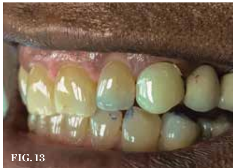
(6.) Tetracycline staining occurs deep in the dentin and is the most difficult stain to remove. (7.) Tetracycline-stained teeth after 7 months of nightly bleaching treatment with 10% carbamide peroxide in a non-scalloped, no-reservoir, custom tray. (8.) Patient with minimal decay that does not need to be restored prior to bleaching because the final shade cannot be determined in advance. (9.) After bleaching over minimal decay, the proper shade can be selected, and the tooth can be restored. (10.) A patient with extensive decay that elicits concerns regarding pulpal involvement as well as the restorability of the tooth needs some type of protective restoration prior to the initiation of bleaching. (11.) The caries is removed, and a protective restoration is placed to allow for further bleaching without concern for the advancement of decay if the patient stops bleaching. (12.) A provisional canine restoration made from bis-Acryl does not exhibit the gloss of the adjacent fixed partial denture or teeth. (13.) Placing a composite sealer provides more natural gloss while bleaching is being completed. Figures 6 and 7 were previously published in Haywood, VB. Tooth Whitening: Indications and outcomes of Night-guard Vital Bleaching. Chicago, IL: Quintessence; 2007 and reproduced with permission.