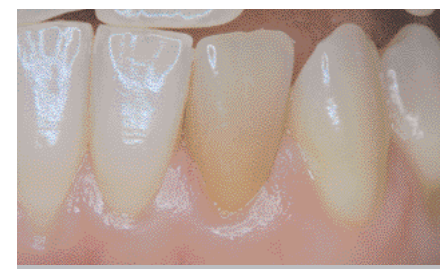
Figure 6A Preoperative image of a patient presenting with a discolored tooth. The patient experienced no pain or discomfort in this tooth.

During the examination it is also important to perform a smile analysis to determine if further treatment may be required, such as replacing existing restorations. In particular, patients must be counseled that existing restorations may no longer blend with their smile once their teeth are bleached. They must also understand the potential outcome of whitening (eg, some provisional restorative materials could exhibit an orange discoloration 16 ), that the restorations will