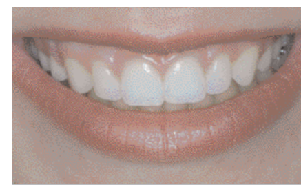
Figure 3B View of the same patient after tooth bleaching.