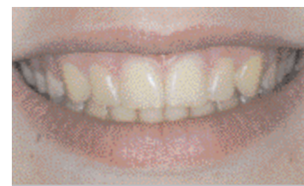
Figure 3A Preoperative view of a patient with genetically yellow teeth.