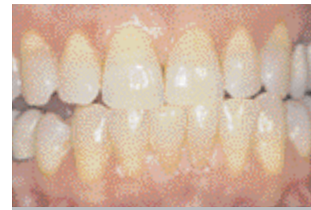
Figure 5A Prebleaching view of an average patient's teeth.