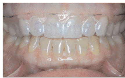
Figure 1A View of a nonscalloped, no-reservoir upper arch tray in the mouth.

This author advocates a nonscalloped, no-reservoir, horseshoe-shaped soft tray (Figure 1A and Figure 1B). However, a different tray design may be required for patients with special considerations, such as those with temporomandibular joint disorder 2 (for whom the tray design should