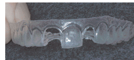
Figure 2 Tray design used when whitening a single dark tooth without altering the color of the adjacent teeth.

Because the tooth is a semipermeable membrane, substances such as peroxide,