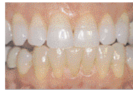
Figure 5B Postbleaching view of the same patient. Note the enhanced esthetics and uniform color change.

more invasive indirect restorative techniques (eg, veneers or crowns).