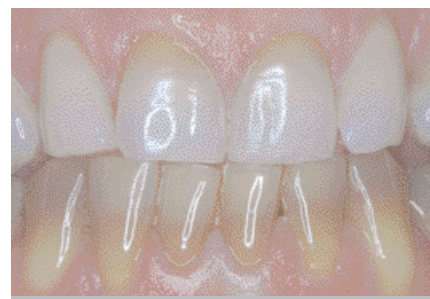
Figure 4B Postbleaching view of the smile after a regimen of nighttime vital tooth bleaching with 10% carbamide peroxide.