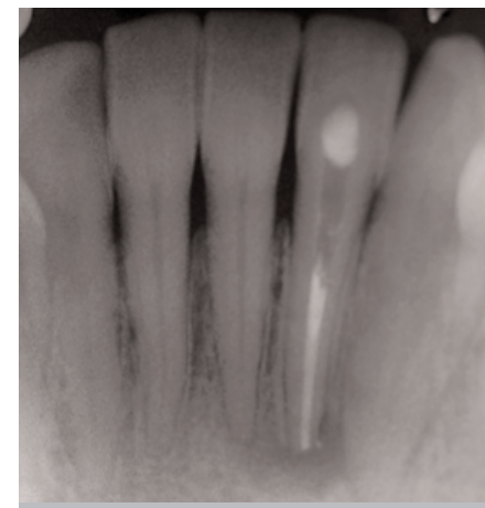
Figure 6C Postendodontic treatment view of the patient. The patient is now ready for bleaching treatment.