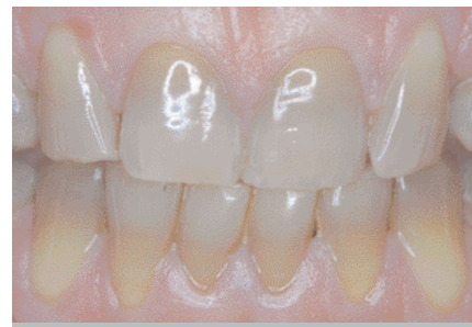
Figure 4A Initial view of an adult patient with severe tetracycline stains.

When cost, safety, and effectiveness of vital nightguard tooth bleaching are considered collectively, nightguard vital bleaching with 10% carbamide peroxide in a custom-fitted tray for changing the appearance of teeth should remain the first consideration for conservatively enhancing smile esthetics. Although bleaching may not be effective in all cases, vital nightguard tooth whitening with 10% carbamide peroxide does not compromise or eliminate any future treatment options. 3 Rather, it may precede other treatments that may be necessary to achieve the patient’s desired results, including macroabrasion and direct composite bonding, esthetic contouring, or