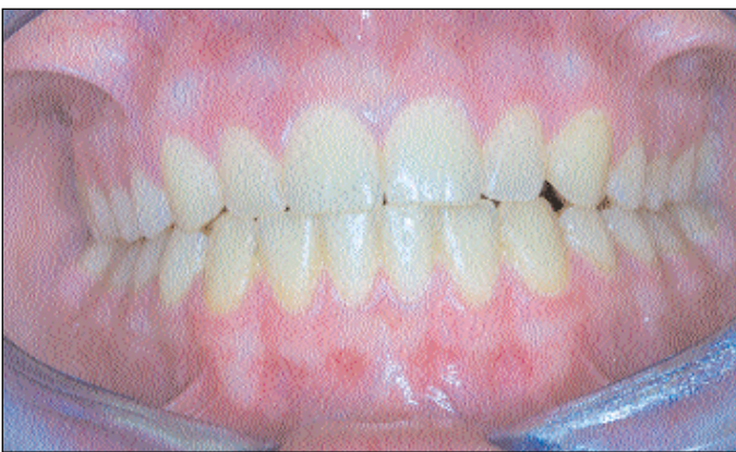
A close up of the teeth demonstrates the baseline colour. Her teeth are shade A4 on a Vita Shade guide, which is a dark yellow

going to pick the shade of the restoration, which will not change, it is important that we determine the overall shade for the teeth.